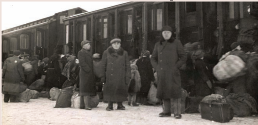
Lodz, Poland, 1942: Jews being deported