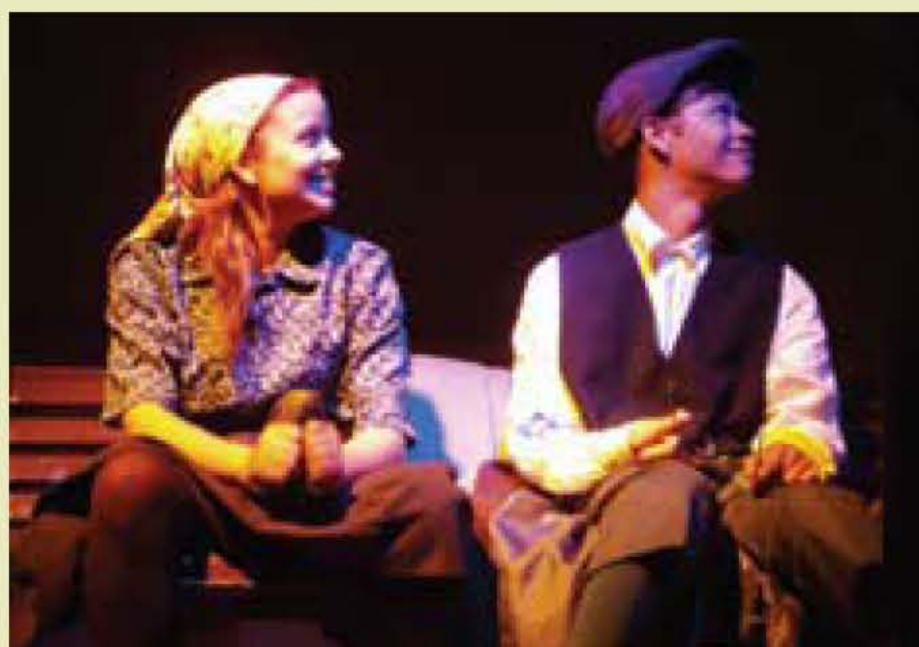
■ Scene and poster from the play, "Los Dilemas del Profesor Heyman"